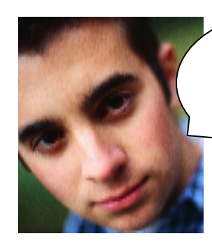
Where were you born? When did you move?